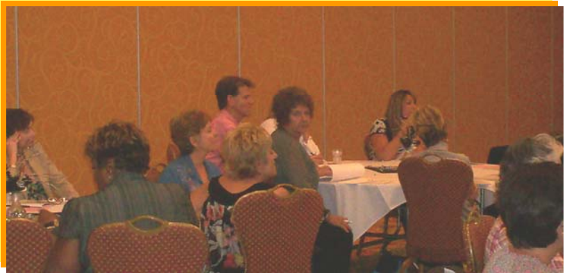
Members listening intently to a key note speaker.